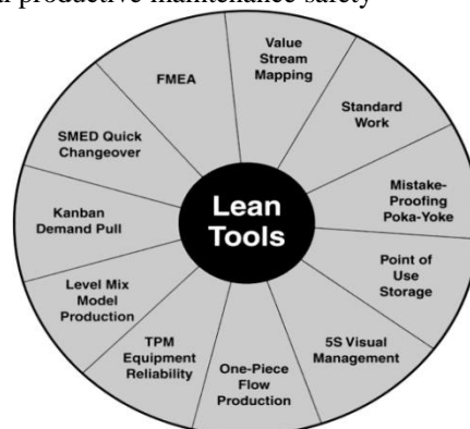
Figure 2: Lean tools