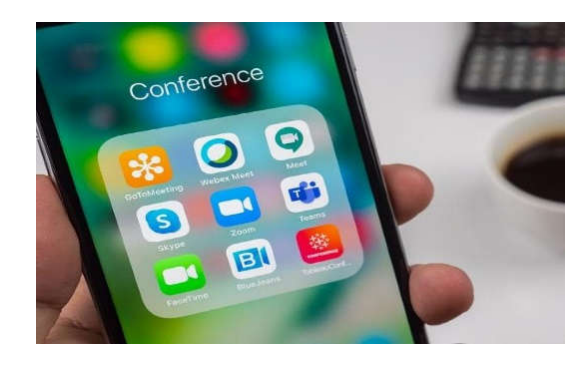
Figure 2: Online Applications

Some of the online education system applications alternative to Zoom are: