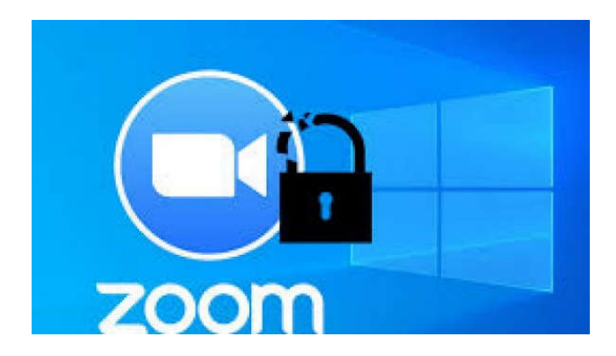
Figure 3: Security breach in Zoom

The major security and privacy issues while using Zoom application are: