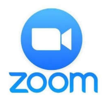
Figure 1: Zoom app

Zoom is a web-based video conferencing tool with an area, desktop client and a mobile app that permits users to satisfy online, with or without video. Zoom users can prefer to record sessions, collaborate on projects, and share or annotate on one another's screens, all with one easy-to-use platform. Zoom offers a quality audio, video, and a wireless screen-sharing performance across Windows, Mac, Linux, iOS, Android, Blackberry, Zoom Rooms, and H. 323/SIP room systems. Securing Zoom Meetings can start before the event even begins, with a robust set of pre-meeting features like Waiting rooms, Passwords and Join by Domain. Zoom ensure that meetings are secure and disruption free through security options in toolbar and allows to Lock the meeting, Remove participants, Put participant on hold, Disable video, Mute participants etc.