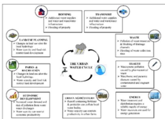
Figure 3: Water cycle in urban area