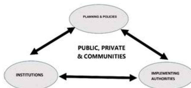
Figure 1: Inter dependency of public, private & communities

Water governance is the range of political, social, economic and administrative systems that are in place to develop and manage water resources and the delivery of water services, at different levels of society.