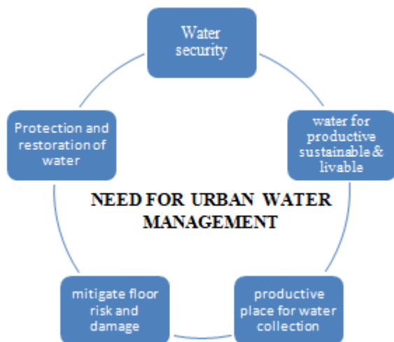
Figure 2: Need for urban water management