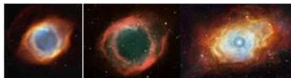
Figure 1: Dumbbell Nebula

Nowhere in the electric current of Nature do we find any justification for assuming that a material nucleus centers the spiral coils which constitute the universe. Instead of that we find the opposite. Nature so stoutly resists having the holes in her coils filled with density that she generates a terrific heat to demonstrate that resistance. That is how suns are made. Resistance to compression generates a terrific heat, which cools as suns expand to hole-centered rings, such as shown in the Dumbbell Nebula.