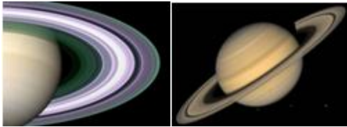
Figure 2: Saturn's rings

The orbits of all planets and suns are rings with holes in them. The outer satellites, which have wound up from rings, illustrate the progression of rings on their journey to disappearance as motion. I am going to prove by the following very simple experiments that there is no justification for the assumption of a nucleus in an atom, which is held together by some mysterious Cosmic "glue" - the descriptive name given to it by eager searchers.