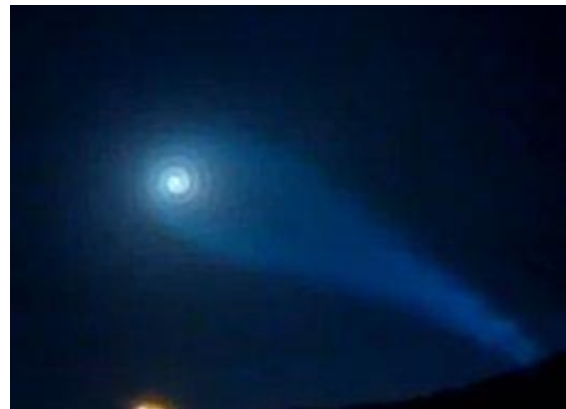
Figure 2: Quantum Intelligence

“Absolutely. It is always the question of trust. When you turn the light switch on, you anticipate light in the room, since you are familiar with the process in 3D and you trust it. It works without any of your knowledge about the physics of photons, electricity or any material properties. Quantum intelligence is a question of extending the trust to the invisible. In your science of physics the study of things in a quantum state will show that infinite connection creates a oneness that therefore has only one universal conscience, namely the Cosmic Law of Self-balance.”