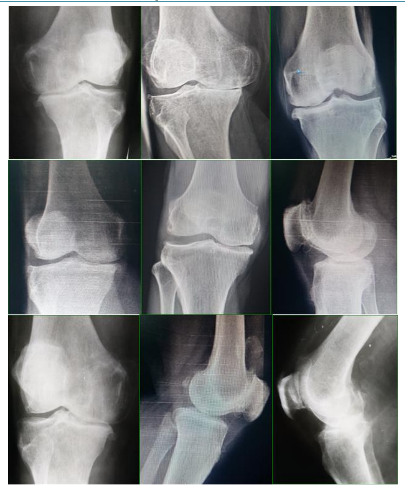
Kellgren-Lawrence Grade 4 Knee Osteoarthritis: Large osteophytes, marked joint space narrowing, severe sclerosis and definite deformity of bone ends.

ResearchGate Impact Factor (2018): 0.28 | SJIF (2018): 7.426