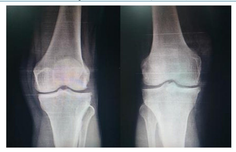
Kellgren-Lawrence Grade 3 Knee Osteoarthritis: Moderate multiple osteophytes, definite joint space narrowing, some sclerosis and possible deformity of bone ends.

ResearchGate Impact Factor (2018): 0.28 | SJIF (2018): 7.426