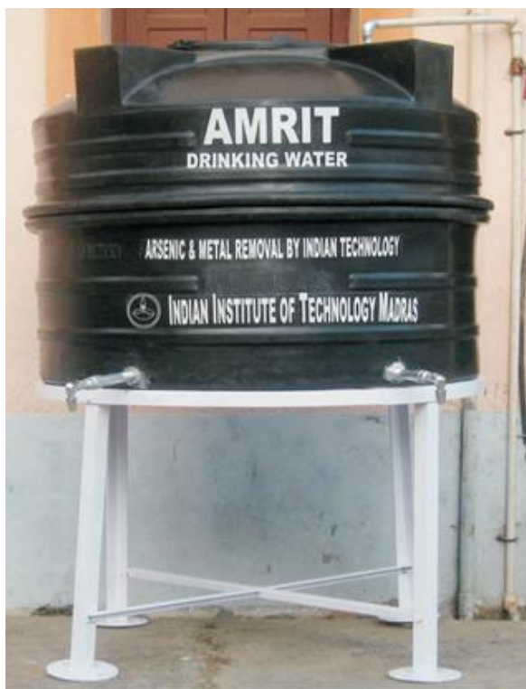
Figure 2: AMRIT Community Water Purification Unit Installed in an Affected Area of West Bengal (in Association with Government of West Bengal)

The acronym AMRIT stands for arsenic and metal removal by Indian Technology (Figure 2). The main component of AMRIT is composed of nanoscale iron oxyhydroxide, prepared with a particle size less than 3 nm. The synthesis of nanoscale iron oxyhydroxide and its efficacy for removal of arsenic from water is described elsewhere [30]. Choice of iron based compounds is based on the fact that they are commonly found in water. Engineering such compounds based on nanotechnology enables them to pick large quantity of arsenic. Particle size below a critical limit increases the number of surface atoms substantially leading to higher surface energy. An important aspect is to ensure that such nanoparticles are strongly anchored onto solid surfaces so as to make sure that they don't leach into water, thereby preventing secondary contamination. Simultaneously, the adsorbed arsenic doesn't get released from the composition, thereby ensuring that spent material can be disposed locally.