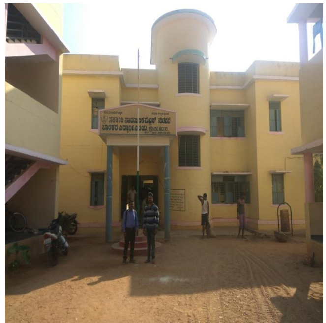
A Picture of SC &ST Hostel for College Students, Hoovina Hadagali