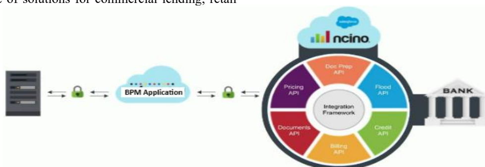
Figure 1: BPM Application Integration with nCino