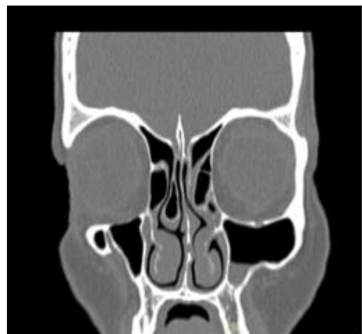
Ethmoid roof keros type II with right concha bullosa