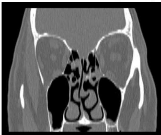
Coronal CT Scan PNS showing left Paradoxical middle turbinate