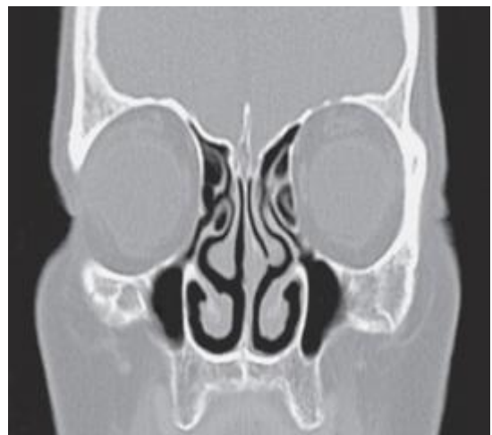
Coronal CT scan PNS showing right unciniate process pneumatization.