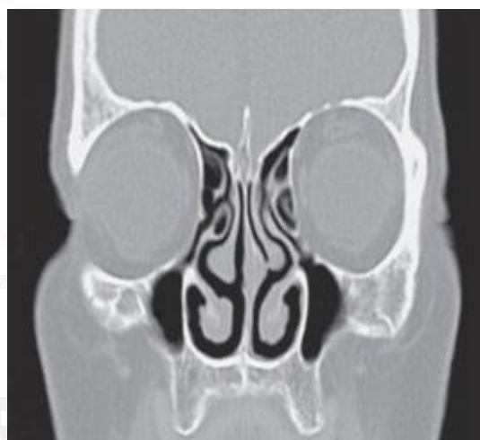
Coronal CT scan PNS showing right uncinat process pneumatization.