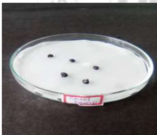
Cold temperature test