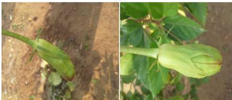
Month of October 2016