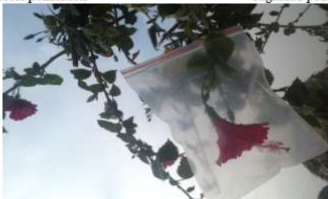
Pollinated flowers are covered