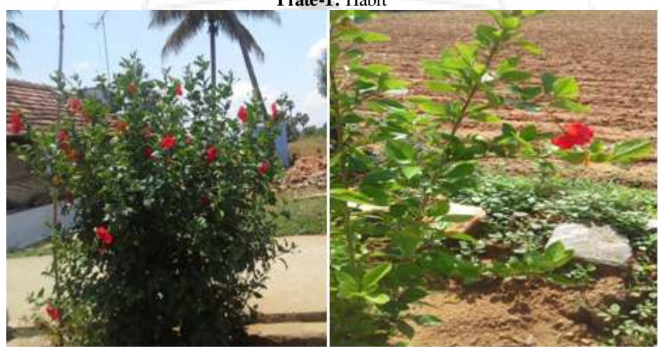
Non-fruit forming plant