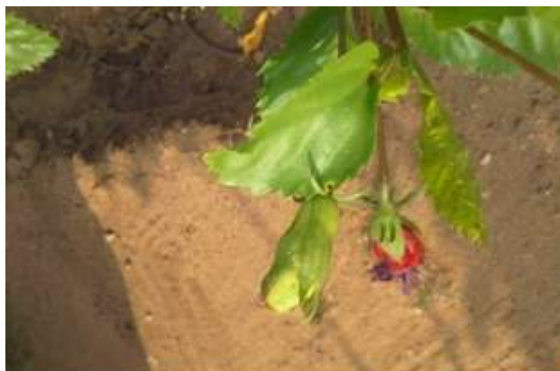
Month of December 2016