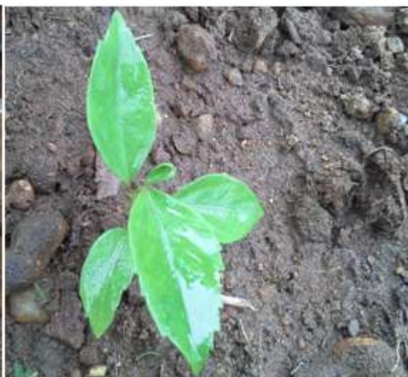
Field Seed Germination