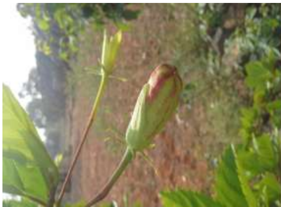
Month of January 2017