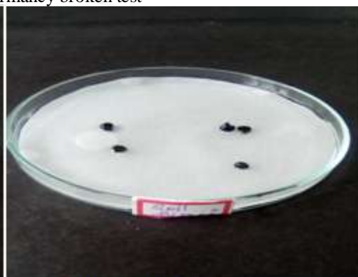
Soil scarification test