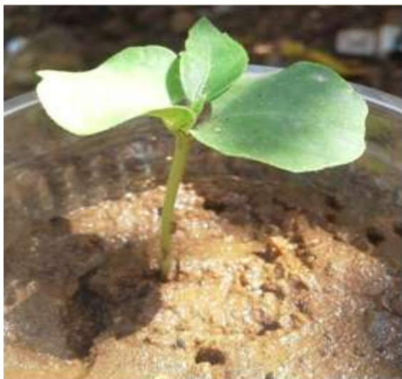
Seed Germination in cup