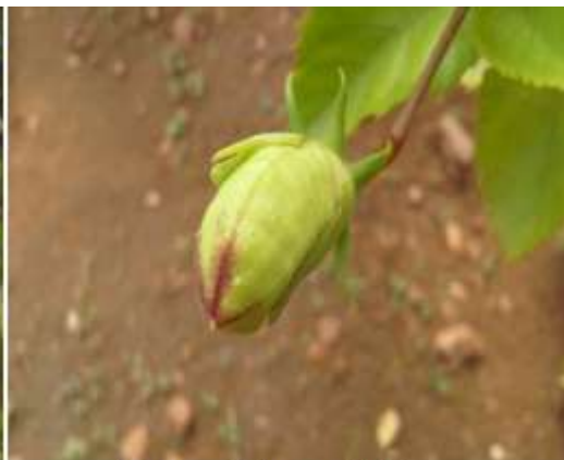
Month of February 2017