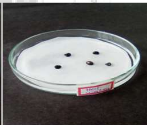
Hot water test