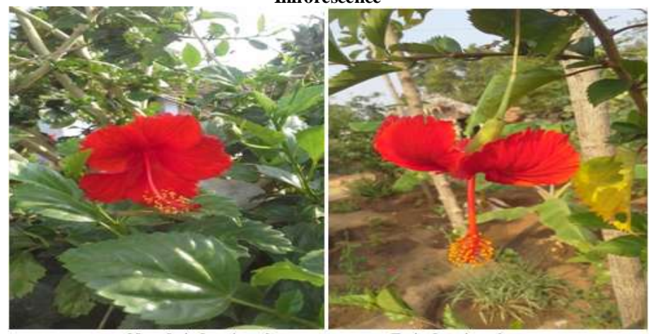
Non-fruit forming plant