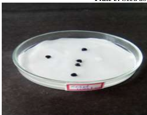
Cold water test