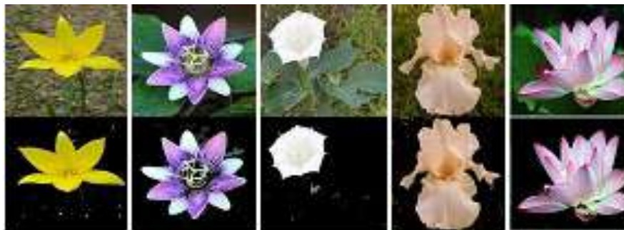
Figure 2: Segmentation result (a) Input images and (b) segmented images.

In order to avoid matching the green background region, rather than the desired foreground region, the image has to be segmented. To segment the flower image, we use a semi-automated threshold-based segmentation algorithm. Figure 2 shows the results of flower segmentation using the threshold-based method on a few sets of images with a cluttered background.