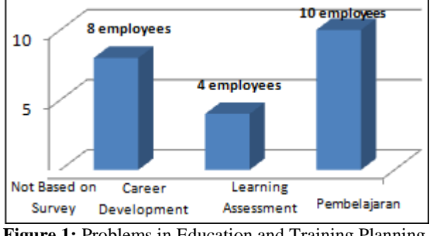
Figure 1: Problems in Education and Training Planning

From the initial interview, the results have been found as follows: