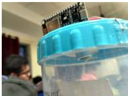
Figure 1: Proposed system model

The proposed model bridges down the human action in the involvement in checking the groceries at a regular intervals of