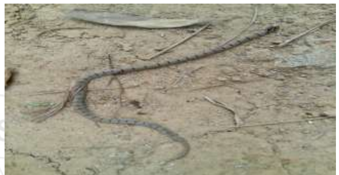
Figure 12: Oligodon arnensis