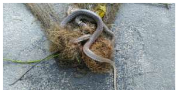
Figure 15: Xenchrophis sanctijohannis