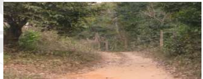
Figure 5: Road passing through Dhaltangarh