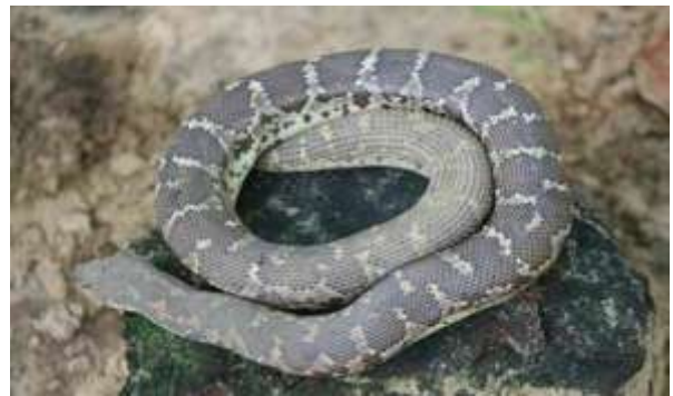
Figure 11: Gongylophis conicus