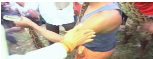
Figure 10: Python bivittatus