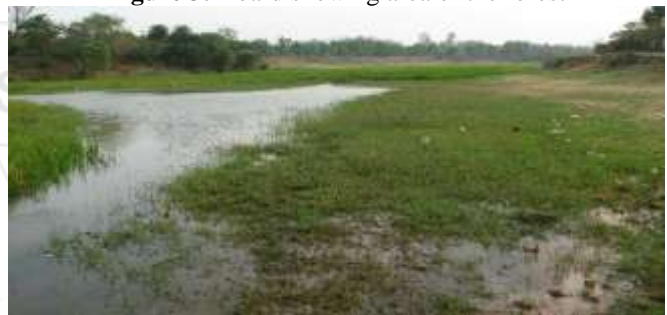
Figure 4: Hansua river, on the shore of which Dhaltangarh is located