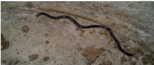
Figure 8: Indotyphlops braminus