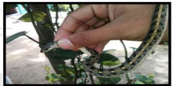
Figure 13: Amphiesma stolatum