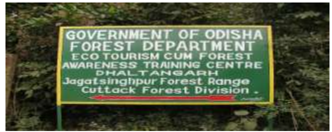
Figure 2: Board showing way to Forest office