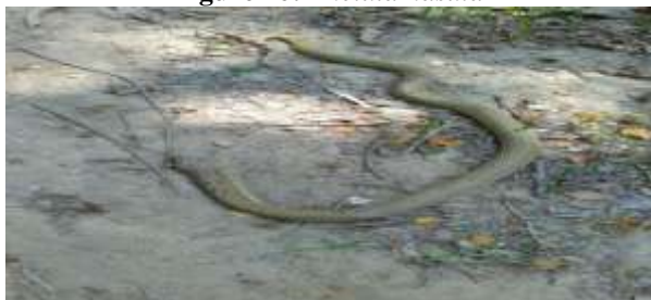
Figure 17: Naja naja