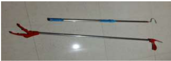
Figure 6: Snake catching stick and snake hook

captured and taken to the nearer forest office and photographed there for study in greater details. Nikon D5600 camera was used to take the picture of the animals. Only those species with confirmed identification are listed in this paper. Exhaustive interviews were carried out with local people and forest staffs.