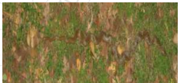
Figure 14: Xenchrophis piscator