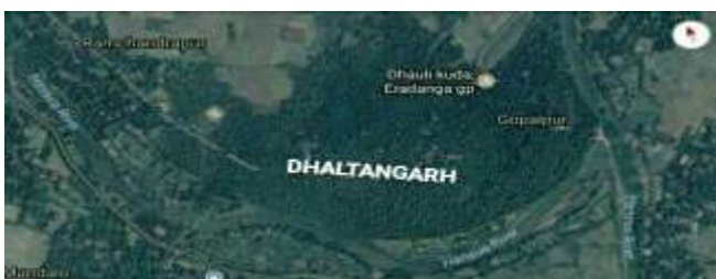
Figure 1: Dhaltangarh Reserve Protected Forest

During summer the temperature is more than 27° C and the minimum temperature is recorded during winter as 15°C. Scattered grasslands, Deer park, Lord Gopinath Temple and Dhruva's birth place are the fascinating attraction of this forest. Dhalatangarh is an excellent habitat of many rare flora and fauna. More than 50 species of plants are seen here out of which many have a great medicinal value. Dhalatangarh is dominated by plants like teak, thorny bamboo, coromandel ebony, Indian gooseberry etc. Faunal diversity of this forest ranges from invertebrates like several spiders, scorpions to vertebrates like deer.