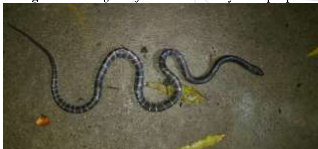
Figure 19: Bungarus caeruleus