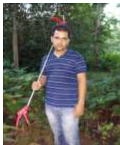
Figure 7: Picture taken during sampling