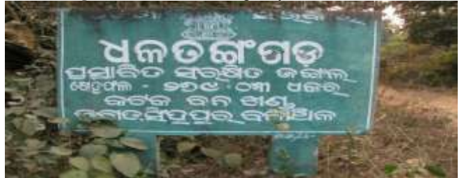
Figure 3: Board showing area of the forest