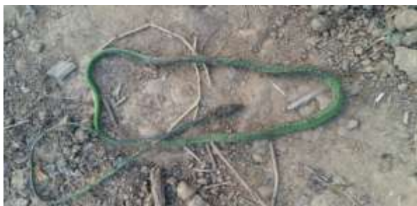
Figure 16: Ahetula nasuta