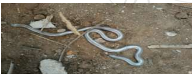
Figure 9: Rhinotyphlops acutus