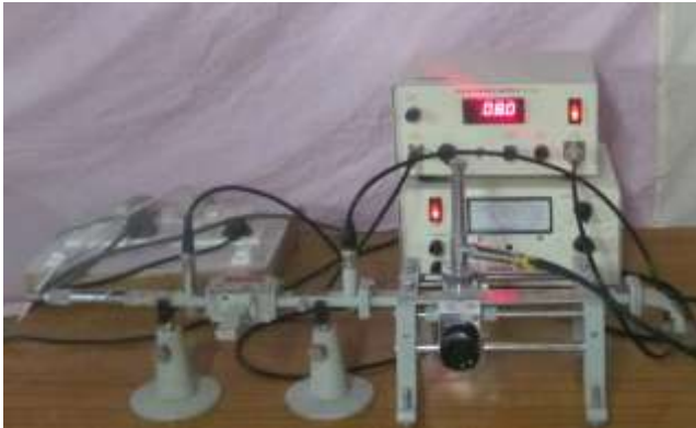
Figure 2: Setup for Measurement of dielectric constant at Ku Band (12.4 GHz-18.0 GHz)

The Design of dielectric sample holder for the cereals, pulses in an important aspect of the measurement technique. The Roberts and von Hippel [25] short circuited line technique for dielectric properties measurements provides a short section of rectangular waveguide with a shorting plate or other short-circuit termination at the end of a line against which the sample rests. This is convenient for particulate samples, because the sample holder, and also for the slotted line or slotted section to which the sample holder is connected can be mounted in a vertical orientation so the top surface of the sample can be maintained perpendicular to the axis of the wave propagation as required for the measurement. The vertical orientation of the sample holder is also convenient for the saturated samples containing distilled water into it.