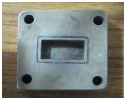
Figure 3: Sample Holder (Ku-Band from 12.4-18.0 GHz)