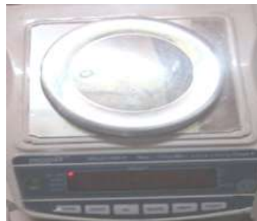
Figure 4: Calibrated sample weighing machine

It is a simple method measurement of dielectric constant of a solid material like pulses. The dielectric constant obtained by using the shift in minima of standing wave pattern inside a slotted section of rectangular waveguide. This shift takes place due to the change in guide wavelength, when dielectric material is introduced in waveguide slotted section by the help of waveguide short circuited cell.