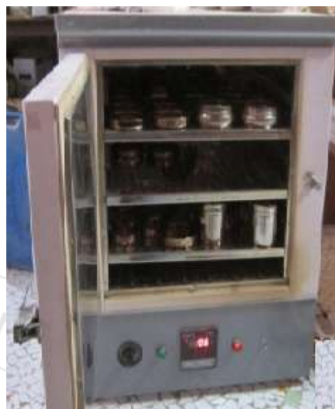
Figure 1: Heater for oven-dried sample (at 110°C)