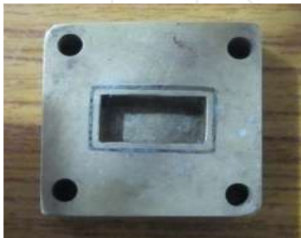
Figure 3: Sample Holder (Ku-Band from 12.4-18.0 GHz)