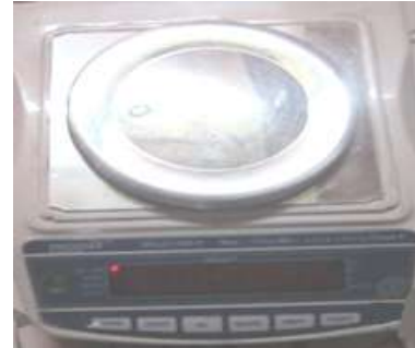
Figure 4: Calibrated sample weighing machine

It is a simple method measurement of dielectric constant of a solid material like pulses. The dielectric constant obtained by using the shift in minima of standing wave pattern inside a slotted section of rectangular waveguide. This shift takes place due to the change in guide wavelength, when dielectric material is introduced in waveguide slotted section by the help of waveguide short circuited cell.