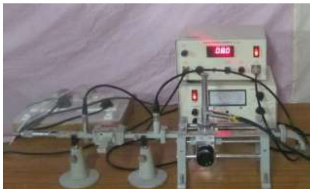
Figure 2: Setup for Measurement of dielectric constant at Ku Band (12.4 GHz-18.0 GHz)

The Design of dielectric sample holder for the cereals, pulses in an important aspect of the measurement technique. The Roberts and von Hippel [25] short circuited line technique for dielectric properties measurements provides a short section of rectangular waveguide with a shorting plate or other short-circuit termination at the end of a line against which the sample rests. This is convenient for particulate samples, because the sample holder, and also for the slotted line or slotted section to which the sample holder is connected can be mounted in a vertical orientation so the top surface of the sample can be maintained perpendicular to the axis of the wave propagation as required for the measurement. The vertical orientation of the sample holder is also convenient for the saturated samples containing distilled water into it.