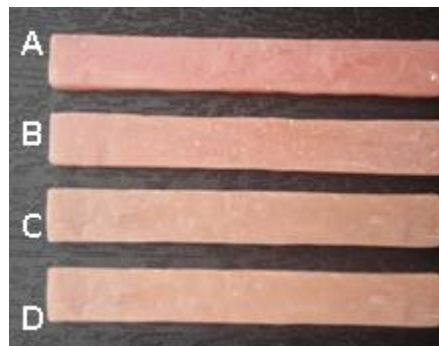
Figure 1: Acrylic specimens A. control specimen 0% fillers B. acrylic specimen 3% Al 2 SiO 5 C. Acrylic specimen 5% Al 2 SiO 5 D. acrylic specimen 7% Al 2 SiO 5

The specimens were grouped into one control group and 3 test groups. As shown in Figure 1. Ten specimens for each group make a total of 40 specimens for each mechanical testing.