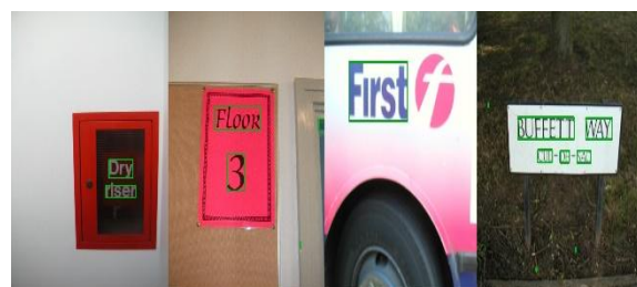
Figure 3: Implementation of proposed text detection method on ICDAR 2011 dataset