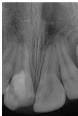
After 3 months