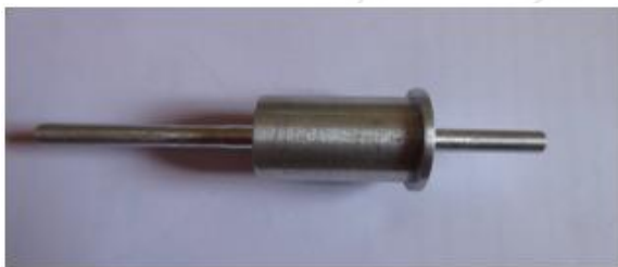
Figure 1: shaft

The shaft here is made up of aluminum as due to light weight and ease of rotation. Also, speeds are not going extreme so aluminum is the best suitable material here. Support is provided at the ends of the shaft via bearings. It is manufactured by simple machining on lathe.