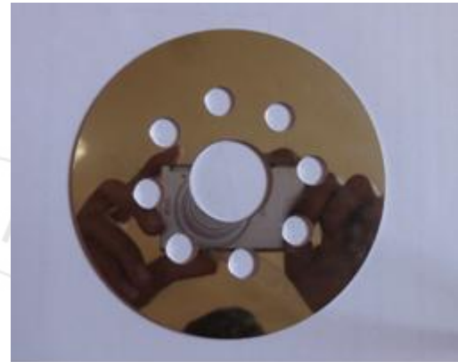
Figure 3: Rotor

required to be generated in the system. For instance, in high pressure turbines larger diameter rotors are required. Here low pressure air is used as fluid and conditions are also moderate. So, hard drive platters were used for this experiment for the ease of material sourcing and construction. Also, the size of the rotors is in direct comparison with the research done by Hoya and Guha (2009) and Guha and smiley (2009). They have a very smooth surface with extremely precise dimensions and were readily available with no additional cost. The material for rotors is aluminum. In larger disks with more rotational speeds are required, higher yield strength material should be preferred such as steel or carbon fiber.