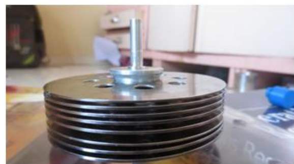
Figure 5: Disks assembly

Discs are mounted on shaft with help of collars which are shown below.