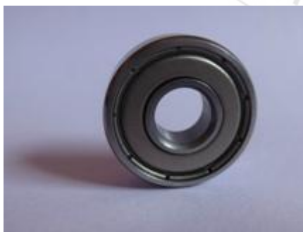
Figure 2: Bearing

Bearings are very critical component as they must be able to withstand considerable amount of heat and high speeds of rotation. For this experiment the bearings used were FAG ball bearings with 17mm as inner diameter and 25mm outer diameter as due to not such extreme speeds were expected.