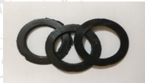
Figure 4: Spacers

In the design, spacers are placed in between the disks and mounted on the shaft. The spacers are intended to be light weight and such as do not hinder the performance of rotation of disk.