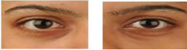
Figure 1: Original Left and Right Periocular Images

periocular region, feature extraction method is done using Local binary pattern (LBP), Histograms of Oriented Gradients (HOGs) and Scale Invariant Feature Transform (SIFT). The human and the machine performance are analyzed based on these algorithms and this not a complete automated system. In this manual intervention is required for the recognition of the features that is obtained using those algorithms.