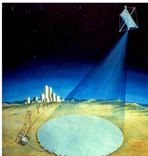
Figure 2: Shows a design of Earth Receiving Station (Rectenna)

The SPS system will require a large receiving area with a Rectenna array and the power network connected to the existing power grids on the ground. Although each rectenna element supplies only a few watts, the total received power is in the Gigawatts (GW).