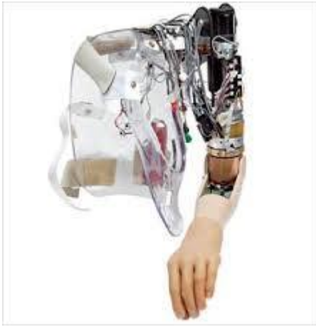
Figure 3: bionic arm

In a commentary published in The Lancet medical journal, Dr Leigh Hochberg, a neurologist at Massachusetts General Hospital, said early results for the new operating system for the limb were "an important step forward in the seamless integration of replacement limbs into the body".