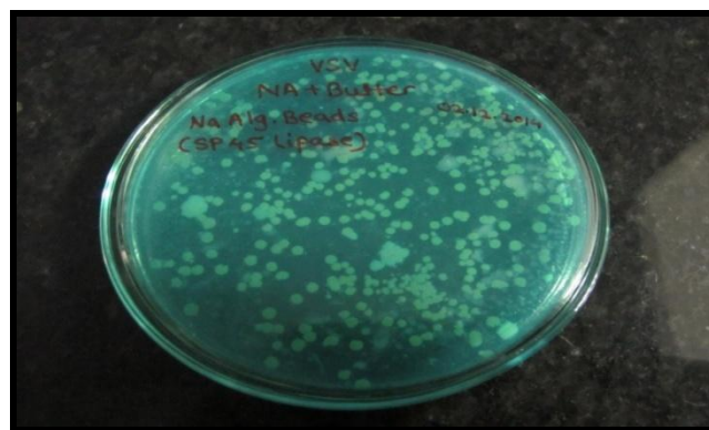
Figure 2: Detection of lipolysis of unsalted butter by Immobilized SP45 Lipase

It was clearly observed that SP45 Lipase immobilized with sodium alginate beads exhibits the activity of lipolysis of unsalted butter as indicated in Figure 2. Copper soap test prominently showing bluish green zone around the colonies was an indication of strong lipolytic activity.