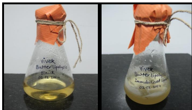
Figure 3: Detection of lipolysis of butter fats by immobilized SP45 Lipase

It was observed that SP45 Lipase immobilized in sodium alginate beads exhibits the properties of lipolysis of butter fats. After 24 and 48 hours of shaking incubation, the flask containing immobilized SP45 Lipase alginate beads showed a clear lipolysis of butter fats when compared with the 'Blank' flasks which lack the SP45 Lipase enzyme as indicated in Figure 3.