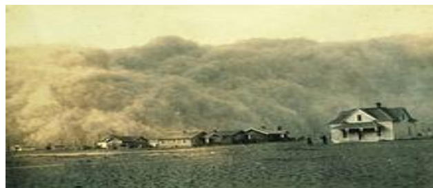
Dust storm approaching Stratford, Texas