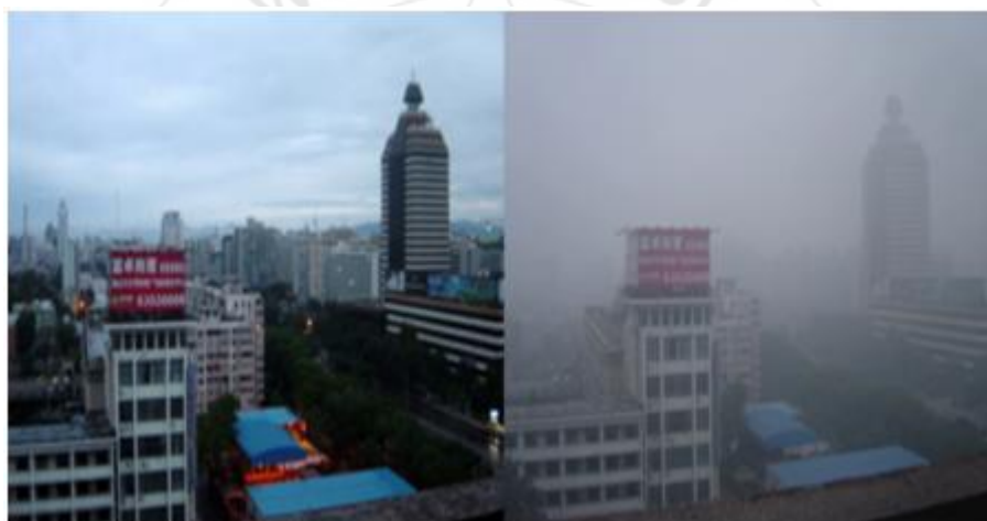
Beijing air on a 2005-day after rain (left) and a smoggy day (right) v Equipment used to control Air Pollution:

Air pollution can be reduced by adopting the following approaches. Ensuring sufficient supply of oxygen to the combustion chamber and adequate temperature so that the combustion is complete thereby eliminating much of the smoke consisting of partly burnt ashes and dust.