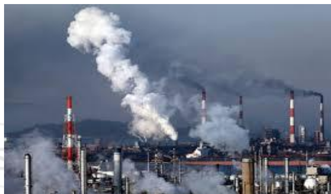
Air pollution from different chemical industries