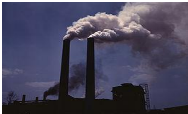
Air pollution from a coking oven

Thus, most heat is absorbed by CO 2 layer and water vapour in the atmosphere, which adds to the heat that is already present. The net result is the heating up of the earth's atmosphere. Thus increasing CO 2 levels tends to warm the air in the lower layers of atmosphere on a global scale. Nearly 100 years ago the CO 2 level was 275 ppm. Today it is 350 ppm and by the year 2035 and 2040 it is expected to reach 450 ppm. CO 2 increases the earth temperature by 50% while CFCs are responsible for another 20% increase. There are enough (CFCs up there to last 120 years)