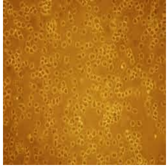
Figure 3: After treatment

The present study shows that MEEA was significantly increased the lifespan than that of EAC bearing mice. The reliable criteria for judging the value of any anticancer drug are prolongation of life span and decrease of WBC from blood [15, 16] . In addition to this, the reduced volume of EAC and increased survival time of mice suggest the