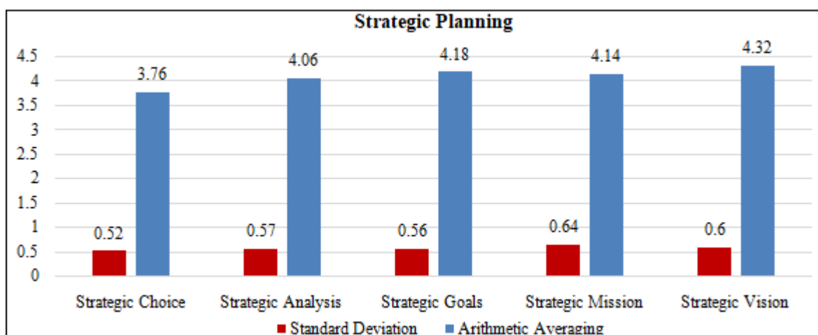
Figure 9: Arithmetic Averaging & Standard Deviation of Strategic Planning

The researcher has resorted to multiple references to come up and conclude and support her research. Generally speaking, and through the gathering of answers from sample study elected for the research, the research has concluded an arithmetic averaging of (4.09) and standard deviation of (0.58) which makes it above the hypothetical mean (3) and at a level (VERY GOOD) which indicates a high level of focus on strategic planning and its relation to the quality of educational services within the university.