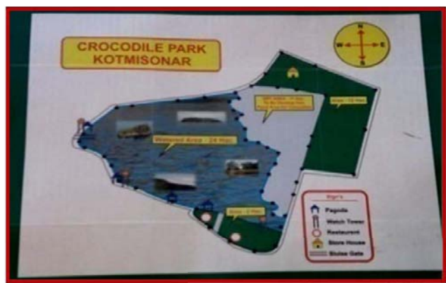
Figure 3: Area of Kotmi Sonar (Mundapond)

Bilaspur and Champa junctions of Chhattisgarh, India [Fig. no. 1]. The Munda pond is spread on 85 acre area. The terrain of Kotmi Sonar is almost plain with gentle slope. The Kotmi Sonar is situated in 620 meters above M.S.L. The underlying rocks are granite, schist and limestone [Bharos and Kanoje, 2007]. In the present study, four study sites [at four corners] were pointed out.