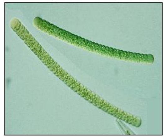
Figure: Nodularia sp.