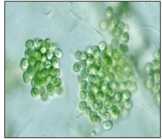
Figure: Aphanotheca sp

Authors are thankful to Principal, Jawahar Arts, Science and Commerce College, Andur, Tal. Tuljapur, Dist. Osmanabad for providing laboratory facilities to carry out the research work.