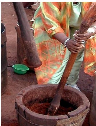
Figure 4: Pounding of the barks