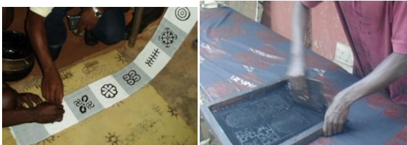
Figure 6: Silk screens and Calabash stamps use for Adinkra cloth production