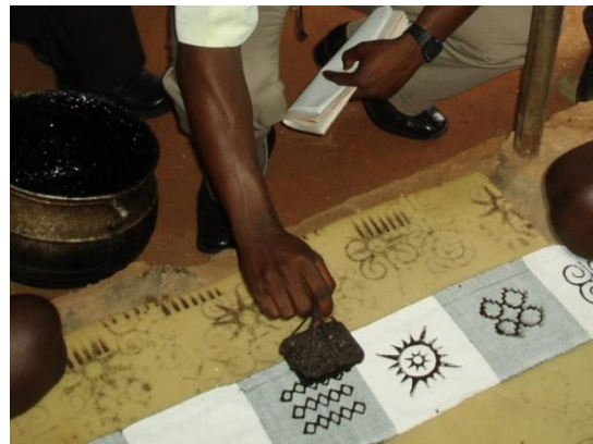
Fig.5. Printing of adinkra cloth

According to Asihene (1978) the large piece of fabric is stretched taut on a clean ground by pegging the ends. Sometimes, the fabric is spread on a floor and covered with hard paper boards and nailed at the corners and the selvages. The stamp block is dipped into the dye bowl and is shaken a bit if it picks too much of the dye. The stamp is applied directly, freehand onto the stretched cloth. The block is stamped on the cloth according to the design planned by the textile designer.