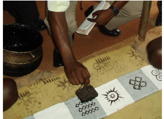
Fig.5. Printing of adinkra cloth

According to Asihene (1978) the large piece of fabric is stretched taut on a clean ground by pegging the ends. Sometimes, the fabric is spread on a floor and covered with hard paper boards and nailed at the corners and the selvages. The stamp block is dipped into the dye bowl and is shaken a bit if it picks too much of the dye. The stamp is applied directly, freehand onto the stretched cloth. The block is stamped on the cloth according to the design planned by the textile designer.