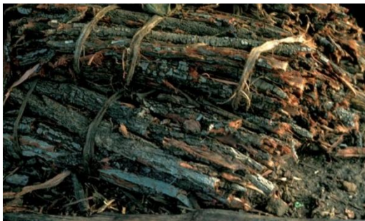
Figure 2: Barks of the Badie Tree