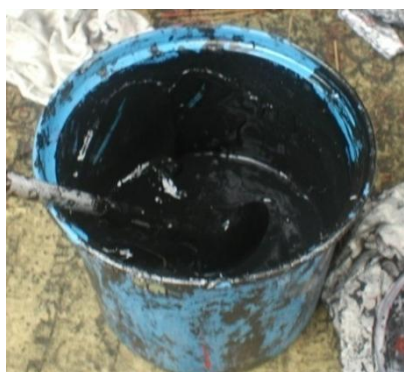
Figure 7: Printing paste imported from Europe

The researcher however noticed that there are some negative impacts of the European elements on the adinkra produced in Ashanti. Some of these demerits are: