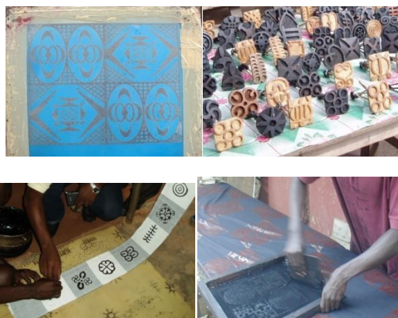
Figure 6: Silk screens and Calabash stamps use for Adinkra cloth production