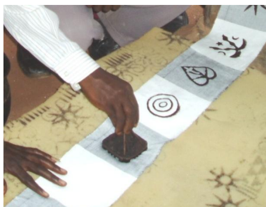
Figure 1: Adinkra stamp held being use in stamping a piece of cloth

The stamps for printing the Adinkra patterns are cut from gourd or pieces of calabash about three inches in diameter. Three or four sticks of stiff palm-leaf ribs are attached to the calabash and tied together at one end to serve as a handle, held between the forefinger and thumb.