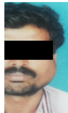
Clinical photograph showing a swelling in the Left parotid region.