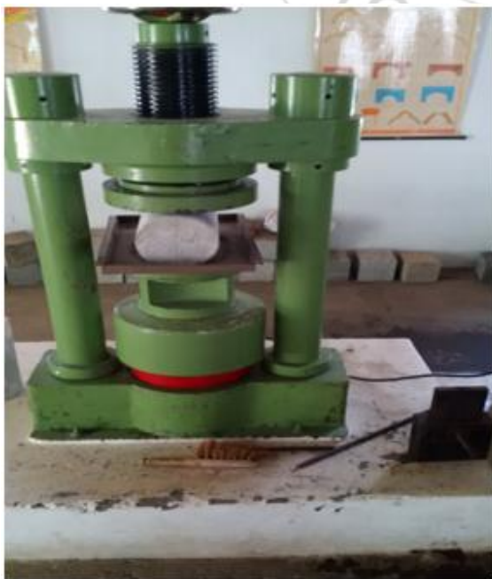
Figure 3: Compressive strength results