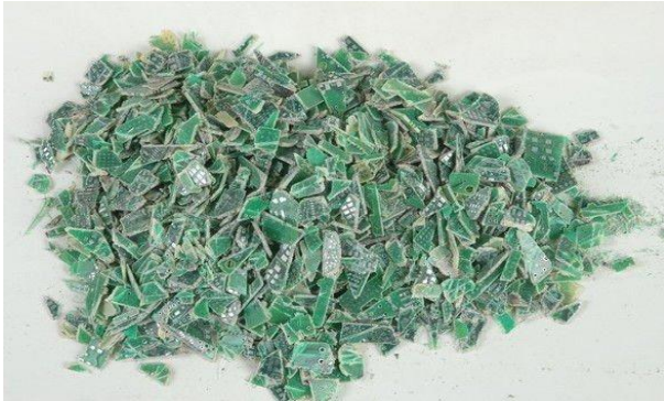
Figure 2: Crushed E-waste

The use of these materials in concrete come from the environmental constraints in the safe disposal of these products. Use of E-waste materials not only helps in getting them utilized in cement, concrete and other construction materials, it helps in reducing the cost of cement and concrete manufacturing, but also has numerous indirect benefits such as reduction in landfill cost, saving in energy, and protecting the environment from possible pollution effects.