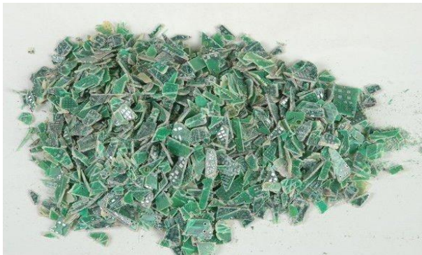
Figure 2: Crushed E-waste

The use of these materials in concrete come from the environmental constraints in the safe disposal of these products. Use of E-waste materials not only helps in getting them utilized in cement, concrete and other construction materials, it helps in reducing the cost of cement and concrete manufacturing, but also has numerous indirect benefits such as reduction in landfill cost, saving in energy, and protecting the environment from possible pollution effects.