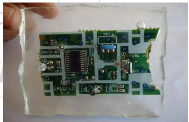
Figure 1: Printed circuit board

cadmium) in landfills come from electronic waste. Consumer electronic is the root cause for the presence of about 40% of the lead in landfills. These toxins can cause brain damage, allergic reactions and cancer. E-waste also contains considerable quantities of valuable materials like gold, copper and other ordinary metals.