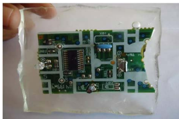
Figure 1: Printed circuit board

cadmium) in landfills come from electronic waste. Consumer electronic is the root cause for the presence of about 40% of the lead in landfills. These toxins can cause brain damage, allergic reactions and cancer. E-waste also contains considerable quantities of valuable materials like gold, copper and other ordinary metals.