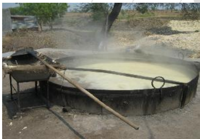
Figure 2: Traditional Jaggery Making Plant

In order to evaluate the system performance of jaggery making furnace, various details such as juice recovery obtained after crushing sugarcane, amount of bagasse obtained, the moisture content before and after sun drying, the amount and frequency of feeding bagasse into the furnace were noted. The temperature of juice during boiling and the temperature of flue gas were also observed.