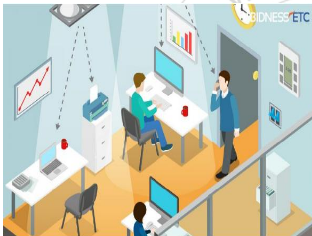
Figure 2: Li-Fi technology in use [11].