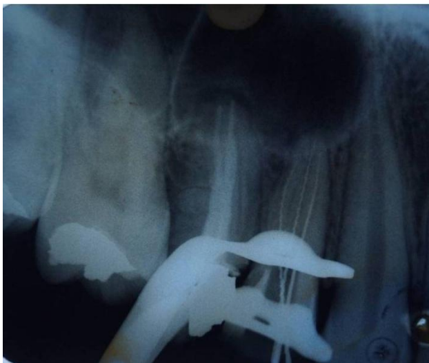
Figure 3: Working Length Determination

At each change of instrument, the canals were irrigated with 2.5 % NaOCl .During root canal treatment presence of 3 canals were confirmed with the aid of electronic apex locator(, two canals in the buccal side that is mesio-buccal and disto-buccal, and third on palatal side.Working length estimated MB1-19 mm,DB-19mm,Palatal-20mm.(fig.3)