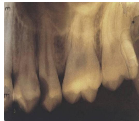
Figure 1: Pre-Operative x-ray

She had history of sharp pain in maxillary right premolar teeth region on having sweet and on food impaction. Considerable tooth destruction by caries was visible distal surface of the tooth and part of the central fissure of the tooth .The x-ray (fig.1)inspection shows 2-roots but due to the overlapping of shades their apical configuration is not clear enough and the presence of 3 rd root canal has not been assumed.