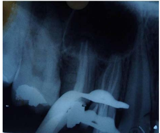
Figure 4: Master Cone

Revo- S (Micro-Mega,Besancon,France) rotary endodontic treatment files used for cleaning and shaping. Cervical preparation done with SU and apical with SC1 and SC2 in the buccal and palatal canals to an apical size 25 with 0.06 taper. RC Help (Prime Dental Products Pvt. Ltd.) was used in all canal preparations and irrigation with 2.5% NaOCl was carried out using 27 gauge irrigating needle 3mm from working length. At each engage of instrument 2ml of 2.5% NaOCl was used. When the instrumentation of root canal completed 17% EDTA irrigation done for 3 min to remove smear layer. The canal was flushed again with 2.5% NaOCl followed by final rinse with 5ml of saline solution. Finally, the root canals were dried with absorbent paper points and the root canals were then obturated with gutta percha and zinc -oxide eugenol sealer using lateral compaction technique.(fig 4&5).