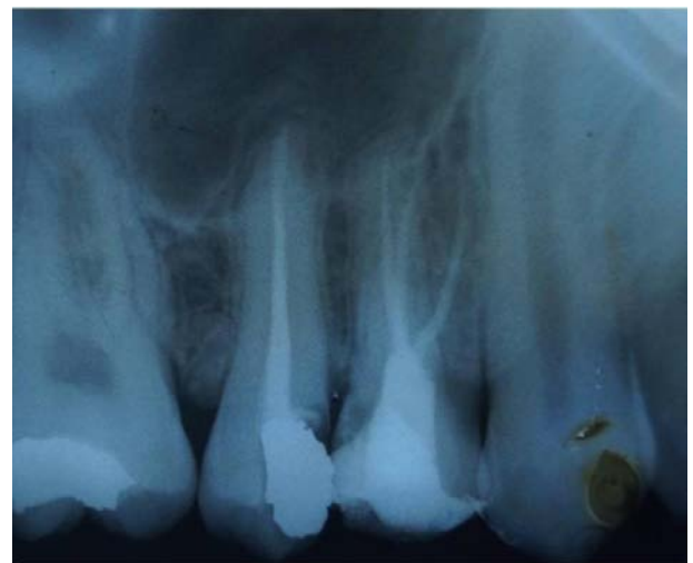
Figure 5: Obturation

The pulp chamber was cleaned to remove excess of gutta-percha and sealer and the tooth was restored with amalgam restoration.