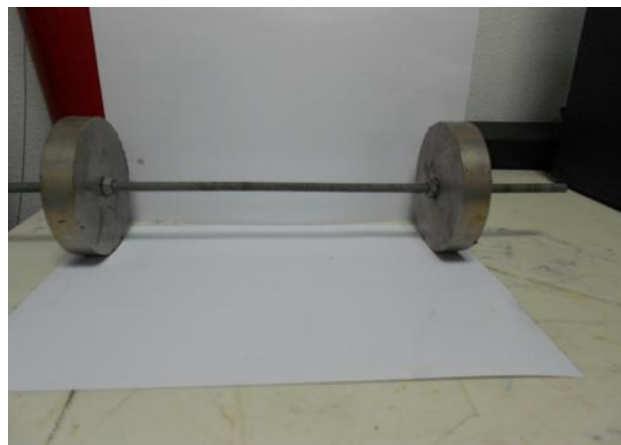
Figure 1: Dipole magnets used in the experiments