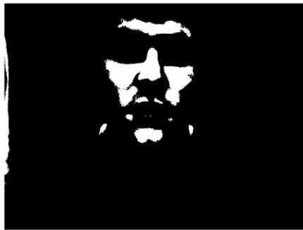
Examples of binarized images with threshold values 100,150 and 200 respectively are shown in Figure III.

The following explains the eye detection procedure in the order of the processing operations. All images were generated in Matlab using the image processing toolbox. A binary image is an image in which each pixel assumes the value of only two discrete values. In this case the values are 0 and 1, 0 representing black and 1 representing white. With the binary image it is easy to distinguish objects from the background. The grayscale image is converted to a binary image via thresholding. The output binary image has values of 0 (black) for all pixels in the original image with luminance less than level and 1 (white) for all other pixels. Thresholds are often determined based on surrounding lighting conditions, and the complexion of the driver. After observing many images of different faces under various lighting conditions a threshold value of 150 was found to be effective. The criteria used in choosing the correct threshold was based on the idea that the binary image of the driver's face should be majority white, allowing a few black blobs from the eyes, nose and/or lips. Figure demonstrates the effectiveness of varying threshold values. Figures use the threshold values 100, 150 and 200, respectively. Figure b is an example of an optimum binary image for the eye detection algorithm in that the background