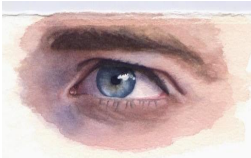
Figure 1: Showing small eyes having less retinal deflection

features of the eye (typically reflections from the eye) within a video image of the driver. The original aim of this project was to use the retinal reflection (only) as a means to finding the eyes on the face, and then using the absence of this reflection as a way of detecting when the eyes are closed. It was then found that this method might not be the best method of monitoring the eyes for two reasons. First, in lower lighting conditions, the amount of retinal reflection decreases; and second, if the person has small eyes the reflection may not show, as seen below in Figure