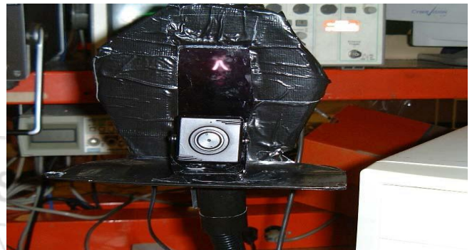
The spectral plot of the wideband infrared filter is shown in figure II.