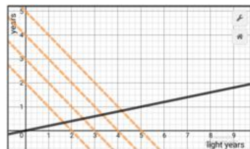
Figure 1: Spaceship traveling away at 5 times speed of light and light rays reaching earth from it

3.13 Again in the above example, when the spaceship is traveling away from earth at five times the speed of light, an observer on earth can see the spaceship only when the light from it reaches earth (which is at the speed of light). ( From earth's perspective ) The spaceship will look as if it is traveling at or near speed of light.