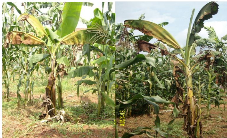
Figure 1: Recent established banana plants showing Xanthomonas wilt disease symptoms indicating that the pathogen was transmitted by infected suckers.

Infected planting material has been reported to be among the most important means of spreading systemic bacterial diseases including Xcm causal agent of BXW [3].