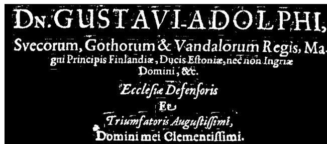
Existing threshold estimation