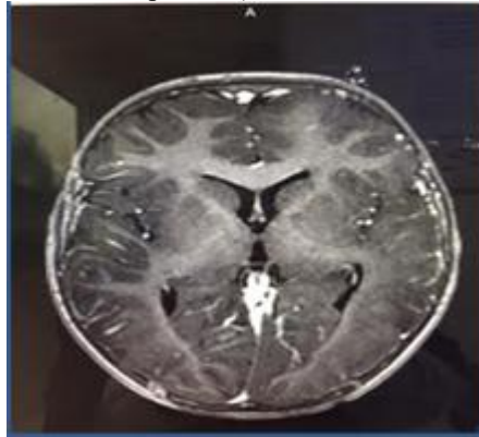
Figure 4: MRA brain

The social worker and physician discussed their findings regarding the reporting of this incident and the relative degree of risk to the child. Taken into account were: the child's age; the psychosocial history.