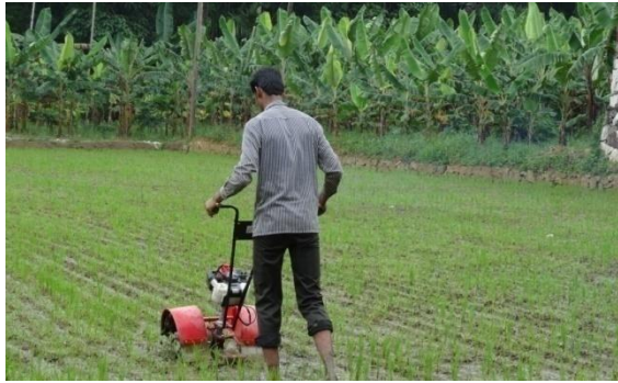
Figure 3: Photographic view of power paddy weeder working in the field