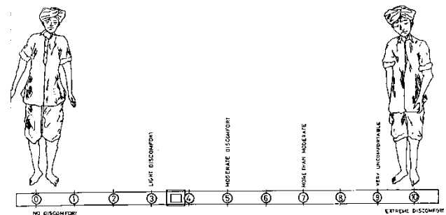
Figure 1: Visual analogue discomfort scale for assessment of overall body discomfort

The recorded heart rate values from the computerized heart rate monitor were transferred to the computer and the values of heart rate at resting level and from 6th to 15th minute of operation were taken for calculating the physiological responses of the subjects. The stabilized values of heart rate for each subject from 6 th to 15 th minute of operation were used to calculate the mean value for power paddy weeder. From the mean values of heart rate (HR) observed during the trials, the corresponding values of oxygen consumption rate (VO 2 ) of the subjects were predicted from the calibration curves of the subjects. The energy costs of the operations were computed by multiplying the value of oxygen consumption (mean of the values of three subjects) by the calorific value of oxygen as 20.88 kJ lit -1 (Nag et al., 1980). The energy cost of the subjects thus obtained was graded as per the tentative classification of strains in different types of jobs given in ICMR report as shown in Table 3 (Sen, 1969 and Sam, 2014).