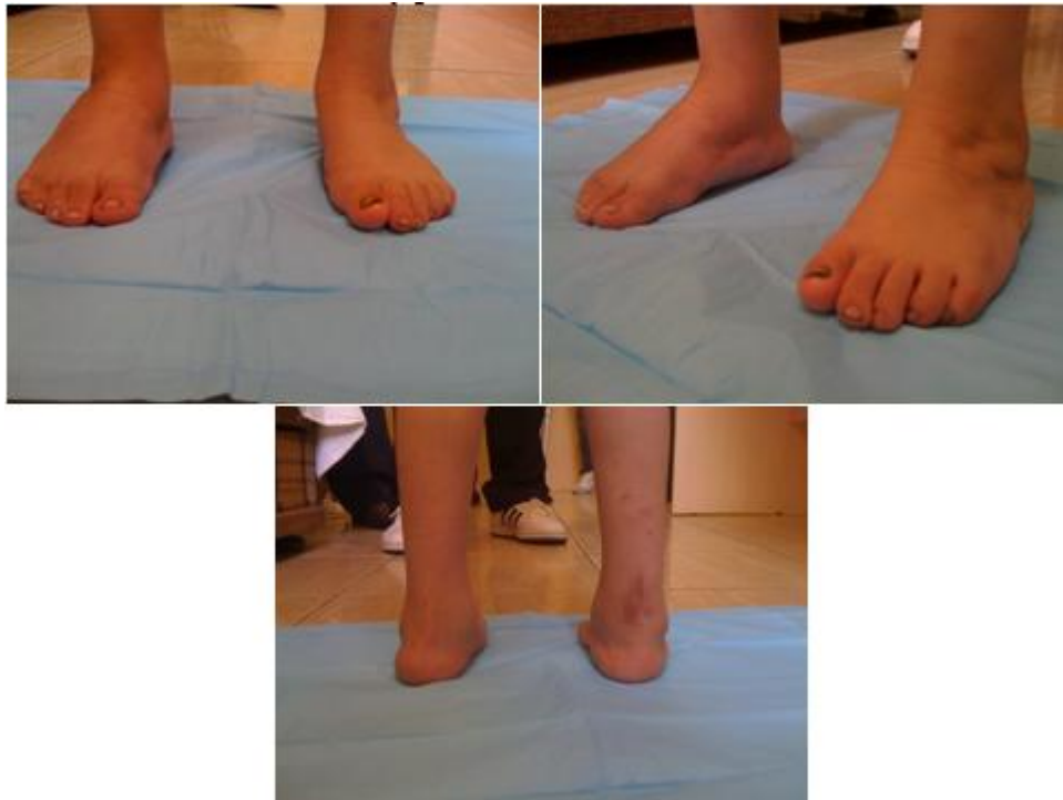
Figure 3: shows one of the cases who was rated as very good result