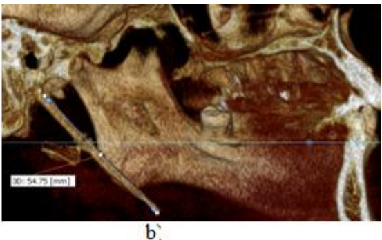
Figure 1: a) Elongated (58.69 mm) right styloid process with pseudoarticulation on VR reconstruction. b) VR image of the left side representing the other elongated (54.75 mm, also with pseudoarticulation) left styloid process.

In our case both styloid processes were with pseudoarticulation (type II) according Langlais classification of the type of elongation [2].