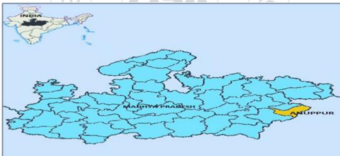
Figure 1: Location Map of India in Madhya Pradesh

The area of Anuppur district is inhabited by a large section of tribal population. The highest tribal population, exists in this tract, totally or partially, depends upon natural vegetation for the necessities of life, including remedies for several diseases. Some of these have a supernatural basis to the tribal mind, while others are recognised as physical and attempts are made to treat them. They usually collect there materials from nearby forests and use them in their health care system, which is well developed and proven successfully for generation together. Considerable work has been done on ethno botanical used by various ailments by the tribals, Brijlal and Dubey(1992); Jain ( 1963 ,1981); Dubey and Bahadur (1966); Raizada(1984); Maheshwari et al , (1990); Khan(2008); and Ahirwar, (2015)are reported (Figure 1-2).