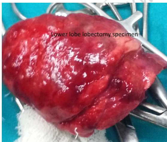
Figure 3: Excised specimen of lower lobe lobectomy.