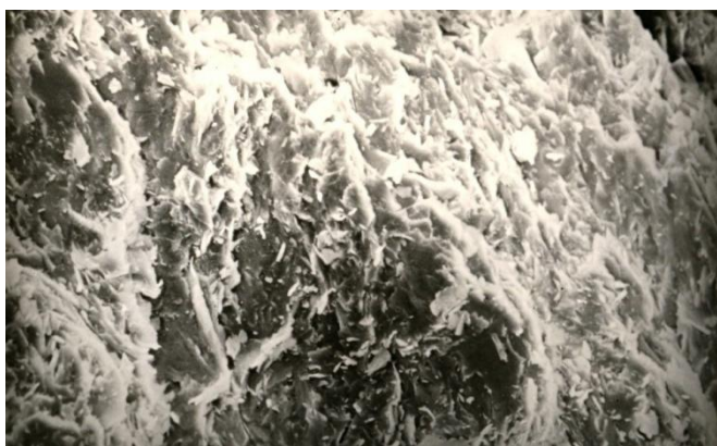
Figure 3 SEM Photo of Raghavapuram Shale/Clay Sample

of vertical differences in texture and/or grain fabric. Vertical differences are manifested by colour and hardness in layers of variable thickness. Parting, however, is a splitting characteristic of shales, often enhanced by weathering, where in planes of separation occur between layers. Stratification is subdivided into beds and laminae at the traditional 10 cm thickness boundary and these in turn are further subdivided. Parting is divided into slabby, flaggy and platy. The term fissile is mostly used as synonym for parting. The thickness of stratification and parting in the shales is related to many factors including rates of sedimentation and compaction. However, field observations suggest that the most obvious factors the composition, grain size and fabric. Stratification and parting generally decrease in thickness as the relative amounts of clay minerals increase, as the degree of orientation of platy minerals increases, and as the percentages of sand and silt sized mineral fragments decreases.