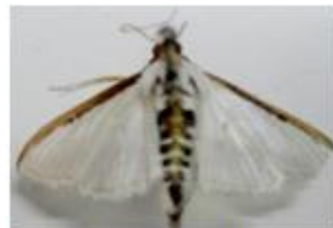
Caprinia conchylasis Guenee