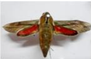
Therata alecto alecto (linn.)