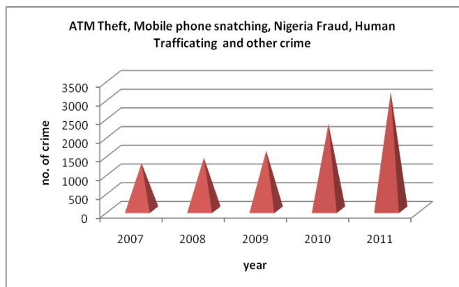
Figure 3: Recent trends of urban crime

In Haora City the rate of crime against women is rapidly increasing. According to the report of Howrah City Police the number of crime against women was 257 in 2007 which is abruptly increased to 614 in 2011. Such crime includes eve teasing, harassment in working place, rape and suicide for dowry etc.