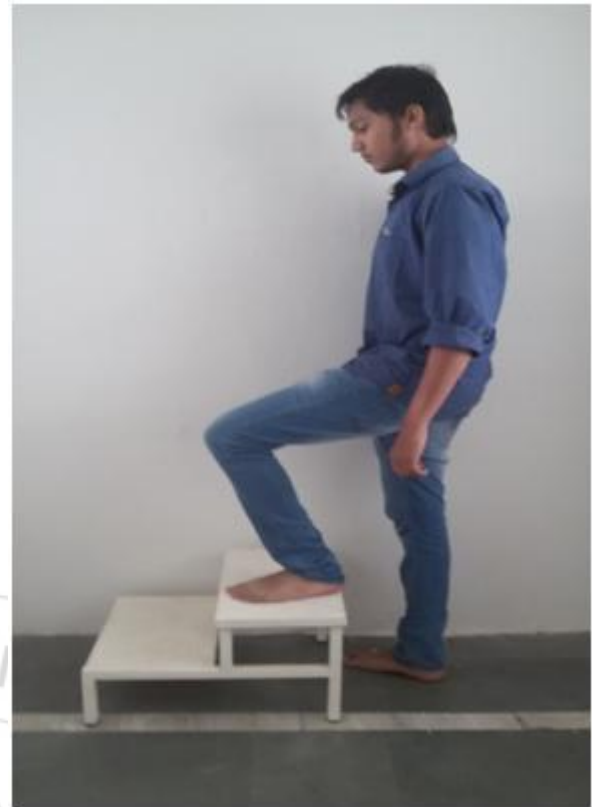
Figure 1: Harvard Step Test

Result: The chi-square is 8.3288. The P-Value is 0.039684. df=3. The result is significant at p < 0.05.